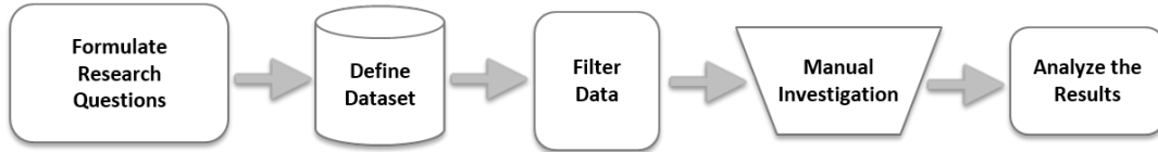
Figure 1: Study Design Overview

since it involves both technical and social communication aspects [15].